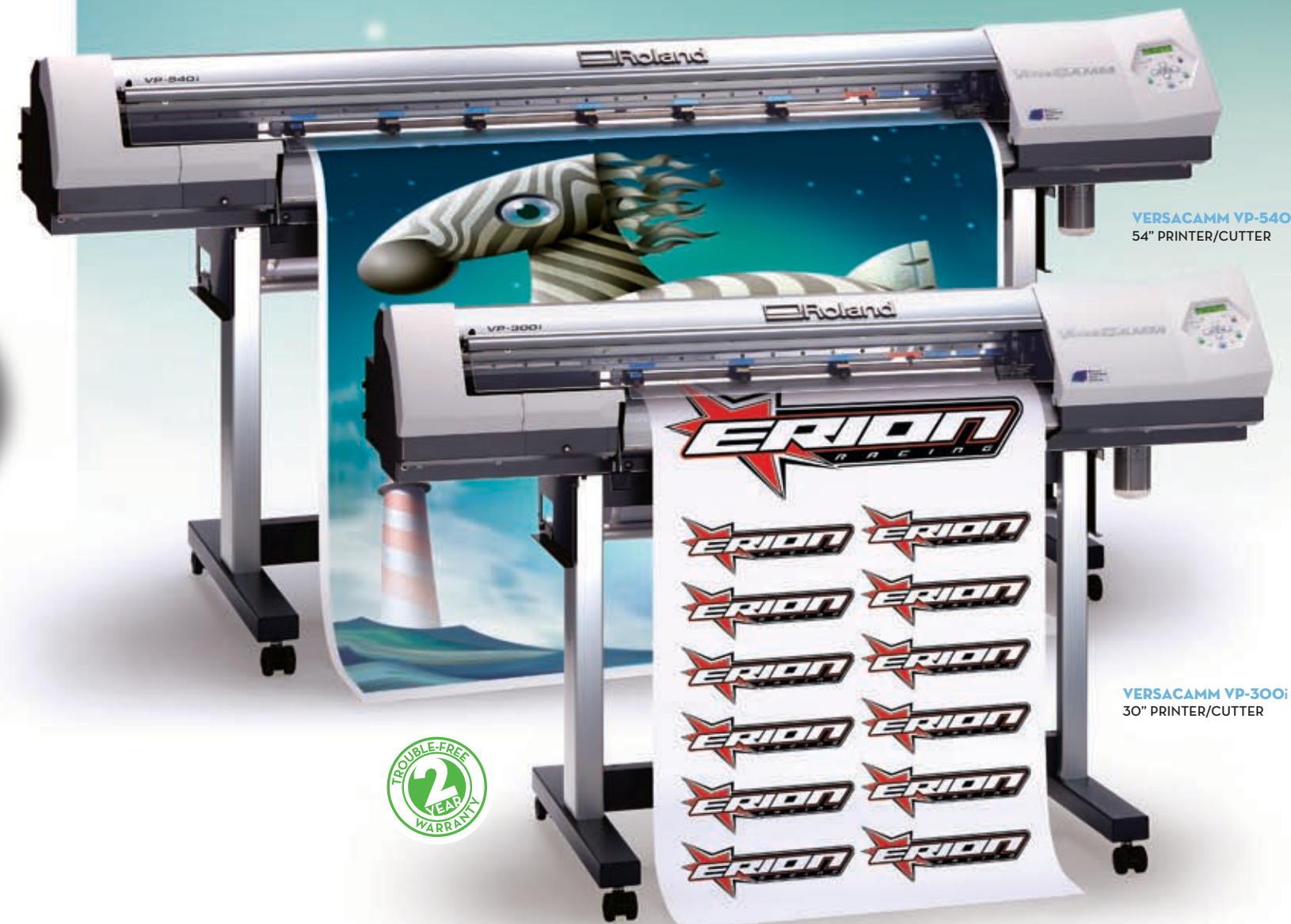
VERSACAMM VP-540i 54" PRINTER/CUTTER

You want to be ready for any job that comes in your door. The VersaCamm VP-i will keep you soaring above the competition.