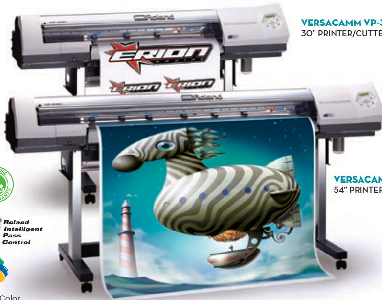
VERSACAMM VP-300i 30" PRINTER/CUTTER