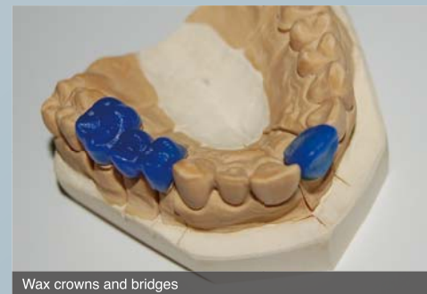
Wax crowns and bridges