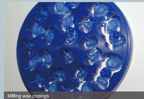
Milling wax copings