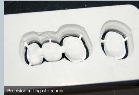
Precision milling of zirconia