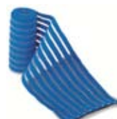
Ref. 60.503 Elastic strips 150x8 cm PG-945/15 FIAB (1 ud.)