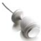
Ref. 279.292 Flat probe (1 unit)