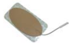
Ref. 31.501 4 adhesive body plates