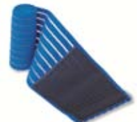
Ref. 60.502 Elastic strips 80x8 cm PG-945/8 FIAB (1 ud.)