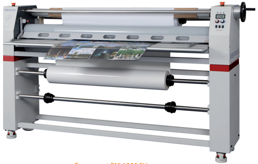
Easymount EM-1200 SH