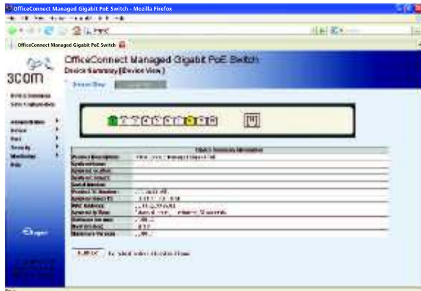
Device summary information for the Managed Gigabit PoE Switch.

With the switch web management interface, even novice users can quickly and confidently configure the switch during initial setup and manage it during normal operation. Graphical switch and port views provide a clear understanding of switch status and configuration.