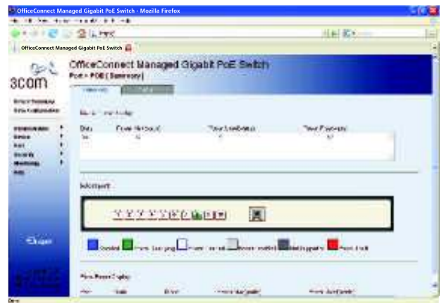
PoE summary information for the Managed Gigabit PoE Switch.