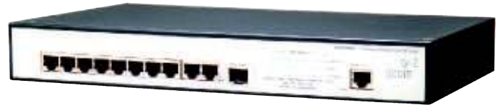
3Com OfficeConnect Managed Gigabit PoE Switch

Link aggregation can be done via IEEE 802.3ad LACP or manually, allowing ports to be grouped together to form an ultra-high-bandwidth connection that greatly