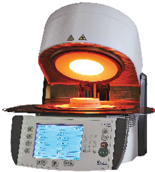
Programat P500 porcelain firing furnace.