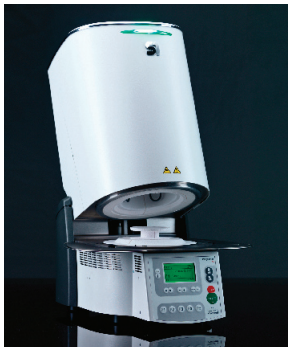
Programat S1® sintering furnace.