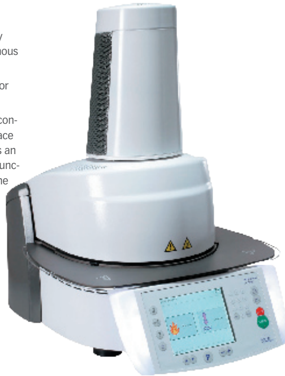
Programat EP 5000 combo firing and pressing furnace.